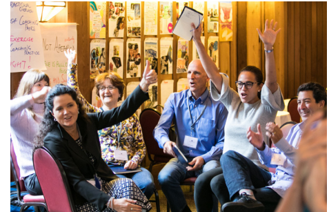
Leading with Inspiration Wednesdays, August 14, 21, 28 8:30 - 11:30 a.m. PDT

Engage and motivate your team as you guide them with a sense of purpose towards a collective vision. Foster a more profound and enduring commitment among team members.