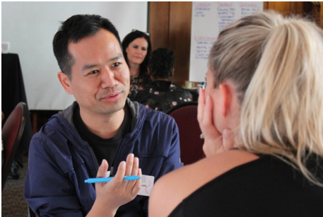
Leading with Trust Thursdays, May 2, 9, 16 8:30 - 11:30 a.m. PDT

Join Berkeley Executive Coaching Institute in our brand-new three-part series of leadership development programs for individuals. These highly-interactive live online courses offer leaders the opportunity to explore different dimensions of your authentic leadership - from building trust to elevating your presence to inspiring at scale.