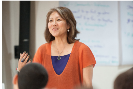
Leading with Presence Thursdays, June 6, 13, 20 8:30 - 11:30 a.m. PDT

Dive deep into the art of commanding presence and captivating storytelling. Say goodbye to uninspired speeches and hello to the power of authentic communication that moves hearts and minds.